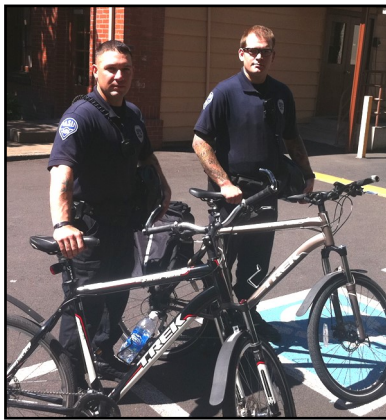
SECURITY SERVICES PROVIDED BY: